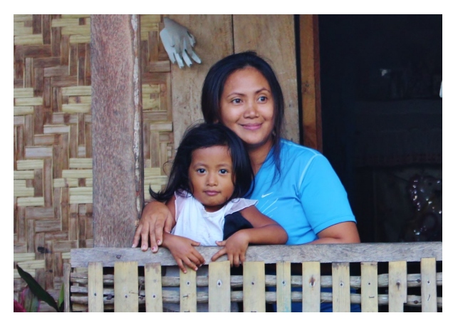
"In our community, we practice the Filipino spirit of helping each other in times of disasters. We support each other especially those who are having difficulty in repairing their houses."