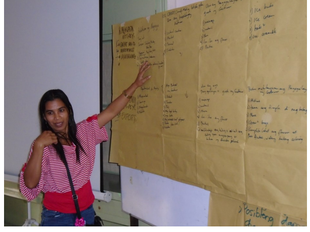
A supported women entrepreneur in Aklan presents a business plan outline for her ice candy making enterprise.