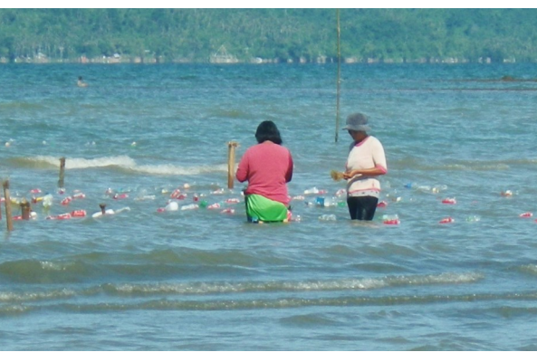
The Sua Livelihoods Association of San Dionisio, Iloilo has started restoring seaweed production. Aside from financial assistance, CARE also supports the association to have access to wider markets, develop entrepreneurial capacity and learn new technology.

AGYLA has set-up a floating cottage and is developing eco-friendly activities for tourists.